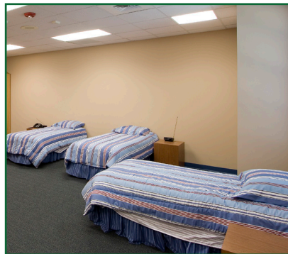
There is a variety of bunking examples to think about!