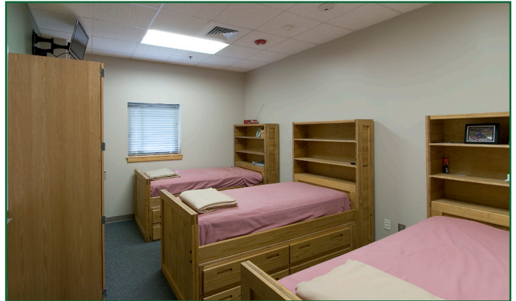
Example of individual, "cold-bunk" sleep room

This approach adds approximately 30% more space to the sleeping areas of the station. For an average station that sleeps six, this cost could be approximately $30,000 in today's construction costs. While $30,000 is nothing to sneeze at, it represents less than 2% of the construction cost for the average station.