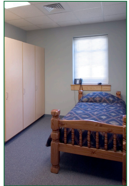
An officers suites which house an office and a sleep room

A practice that we see increasing is to design one or more officer suites which house an office, a sleep room, and a toilet/shower room for the particular officer. These officer suites are often located in the administrative area of the station instead of the private, night areas.