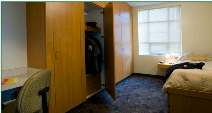
Individual Sleep Room

One wardrobe locker is normally provided for each sleeper – typically three – that utilizes the room. Some provide a fourth locker to the swing-shift or off-shift worker utilizing the room. Wardrobes with flat tops are often seen as beneficial as extra space for bin storage, while others request a sloped top so as to keep visible clutter from accumulating. Most provide space for a desk which may, or may not also double as the night stand and serves as a quiet study location.