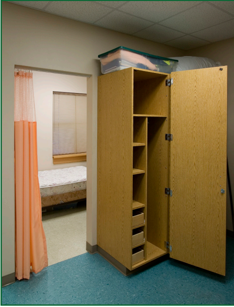
Flat-top wardrobes allow for extra storage on top

A computer connection is often provided at the desk location if WI-FI is not available in the station. If the night stand is not provided, a shelf near the head of the bed is convenient for a lamp, clock and cell phone.